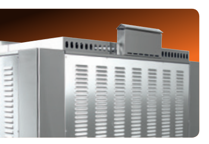
FULL STAINLESS STEEL CONSTRUCTION WITH CHIMNEY FLUE

Still deciding between a conveyor oven and a traditional deck oven? Look no further! SIERRA brings you both.