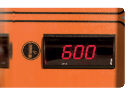
DIGITAL TEMPERATURE DISPLAY